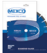
Mexco Diamond Blade product packaging