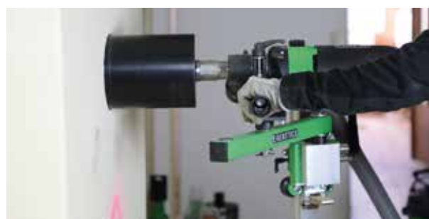
Core drilling for the chimney connection

Elektrowerkzeuge GmbH Eibenstock Auersbergstraße 10 08309 Eibenstock